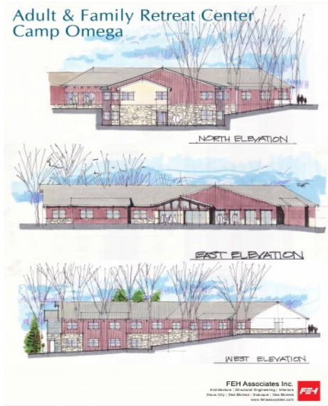
Adult & Family Retreat Center Camp Omega